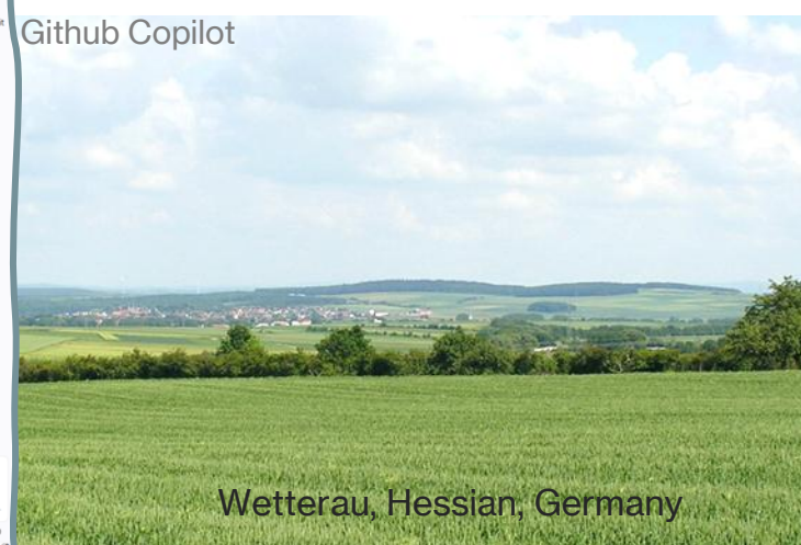
Wetterau, Hessian, Germany